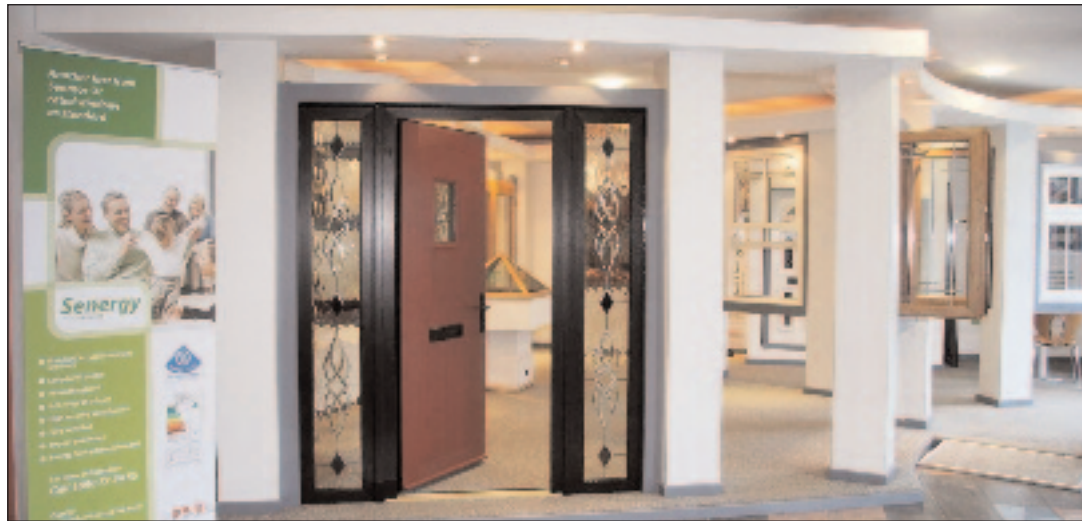
■ Some of our windows and doors that can be seen at our Wexford showroom.