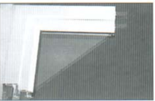
PVCu extrusions are re-inforced with galvanized steel